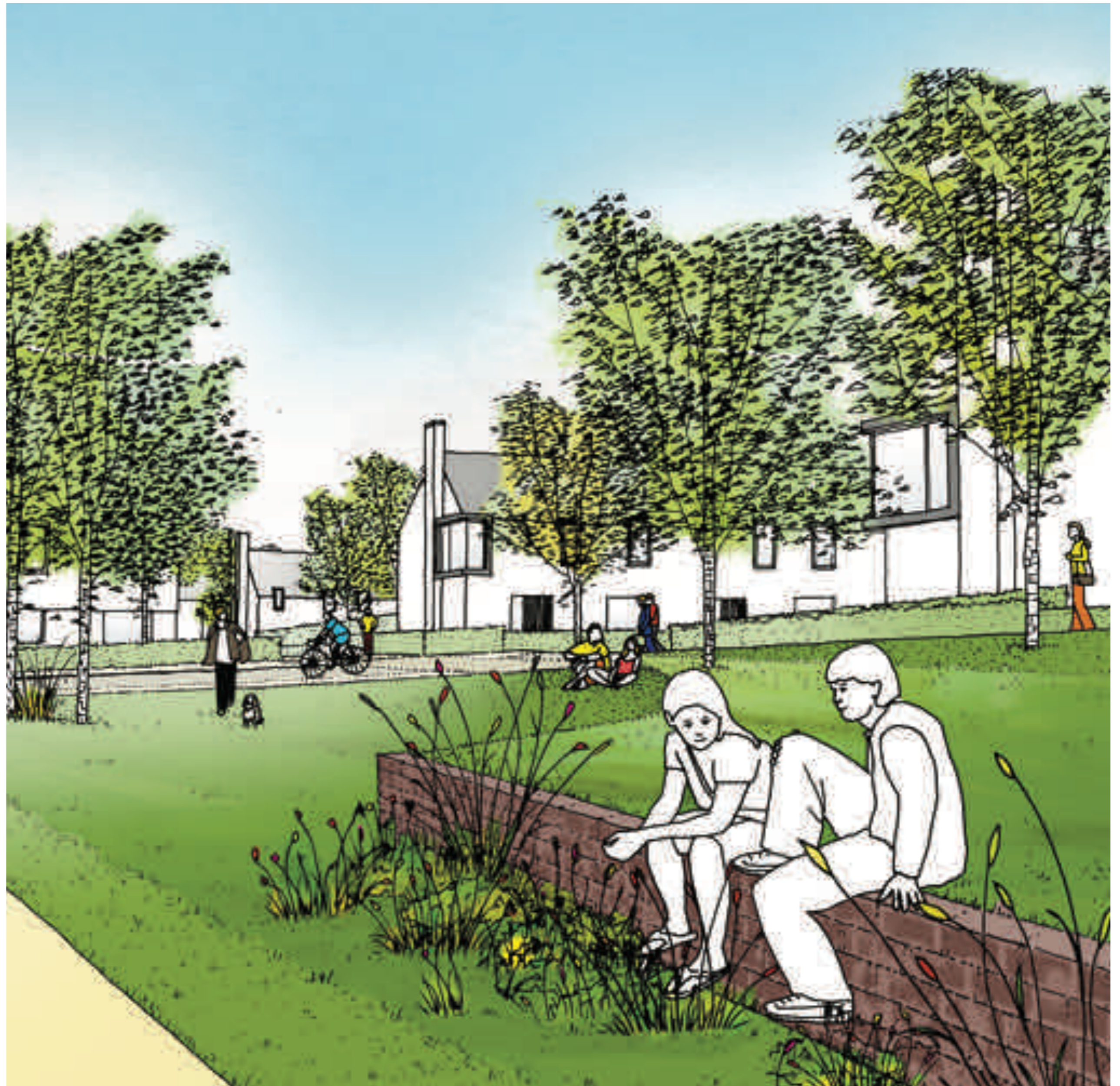
2 STOREY HOUSING TOWARDS THE LANDSCAPE EDGES OF THE SITE

A further feedback form is available for any additional comments, prior to the submission of the planning application.